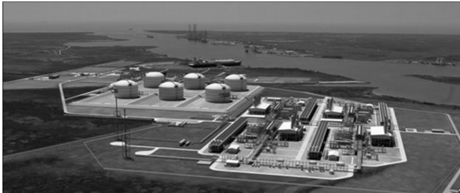
Cheniere Energy Partners is adding a natural gas liquefaction and export complex to its existing import terminal near Sabine Pass.

Developing and emerging markets are also helping to drive U.S. domestic output as nations continue to advance, and newly created middle classes are expanding in places such as Brazil, China, India, and South Africa, which increases demand for feedstock, energy, and the consumer products their new